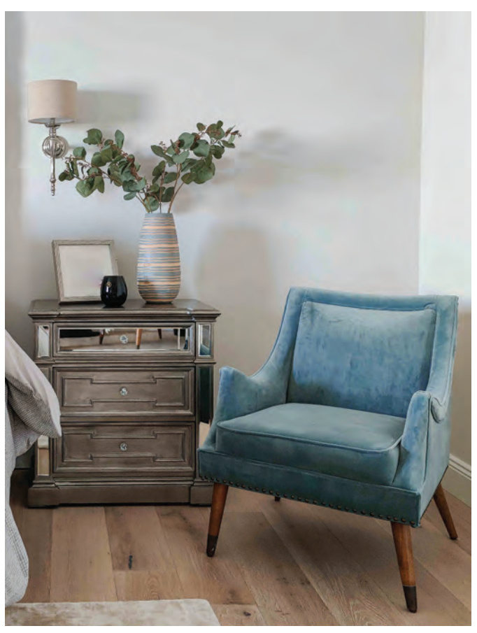
"THE SOFT BLUES OF THE MAIN BEDROOM ARE INSPIRED BY THE COAST AND TEAMED WITH NATURAL COLOURS IN CUSHIONS, WINDOW DRESSINGS AND BED LINEN FOR RESTFUL SLEEP."