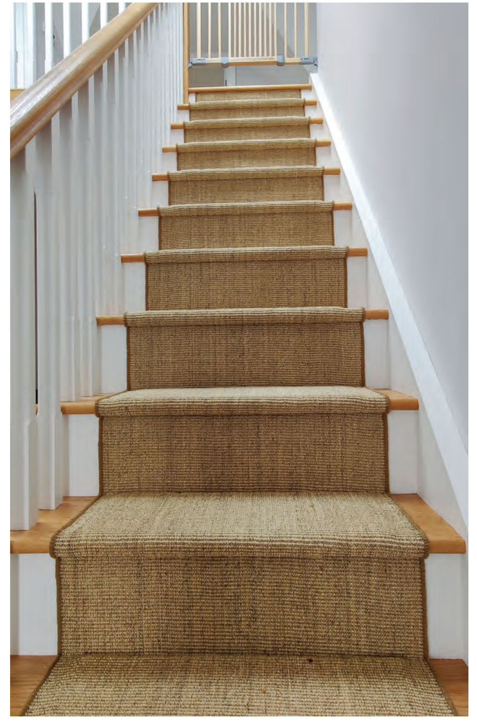
"SISAL IS A VERY PRACTICAL, LOWMAINTENANCE MATERIAL FOR A BUSY STAIRWAY AND IT ADDS A BEAUTIFUL NATURAL TEXTURE TO THE SPACE."

calming and timeless. "The main function of the space was to provide enough seating for the whole family and some guests. It is the main TV room in the home so it needed to be comfortable for rainy days filled with movies and games," Helena outlines.